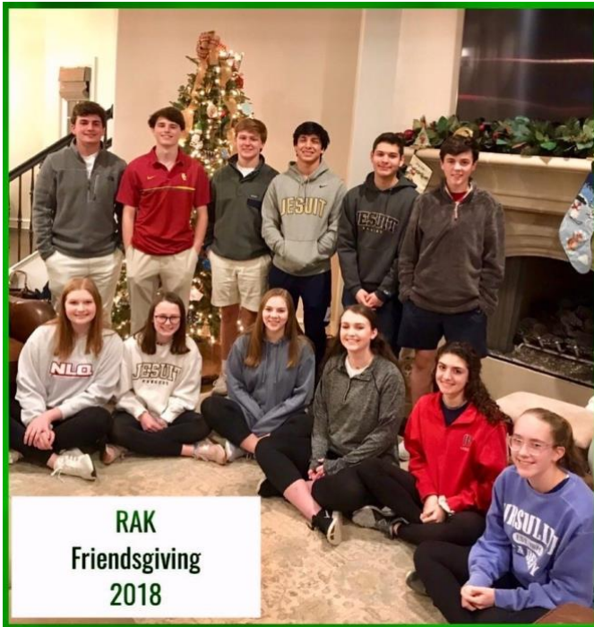
Original RAK Group from 2014