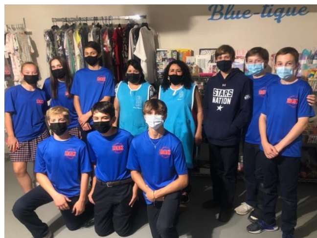
RAK Group @ Mater Filius